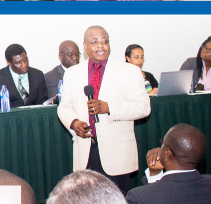
Pre-proposal Meeting for Tariff Study and Tariff Plan Consultancy