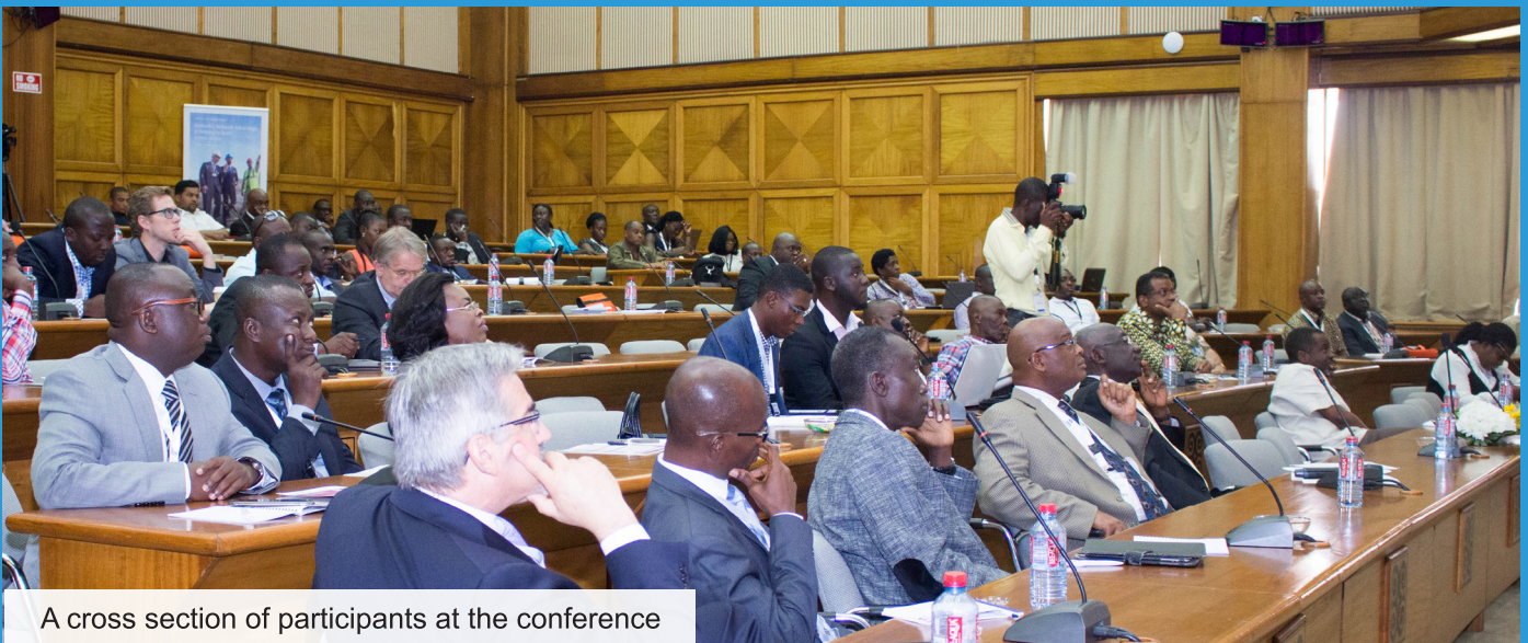
A cross section of participants at the conference