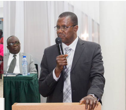
Pre-proposal Meeting for Program Management Consultancy