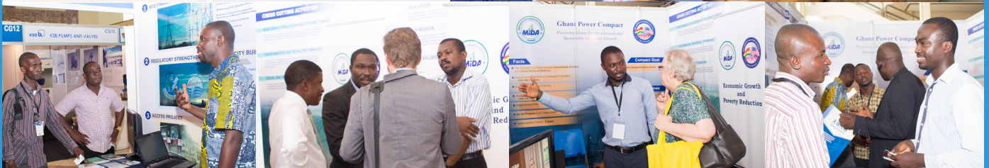
Some officers of MiDA engaging visitors at MiDA's exhibition booth