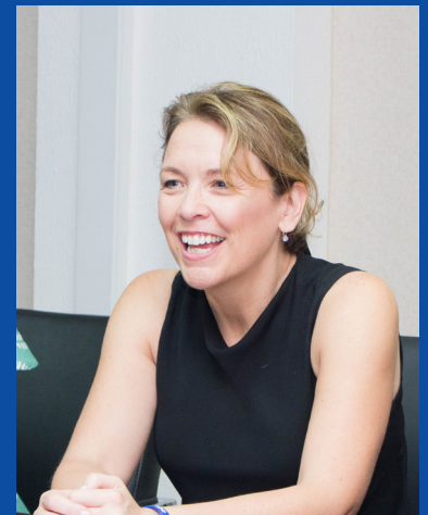
Ms. Dana Hyde, MCC CEO

Ghana is receiving US$498.2 million from the MCC to implement various projects aimed at reforming as well as building and improving infrastructure in Ghana's power sector. The Compact grant to Ghana is the largest U.S. Government Power Africa transaction to date, and one that is expected to catalyze billions of dollars in private investment in the power sector.