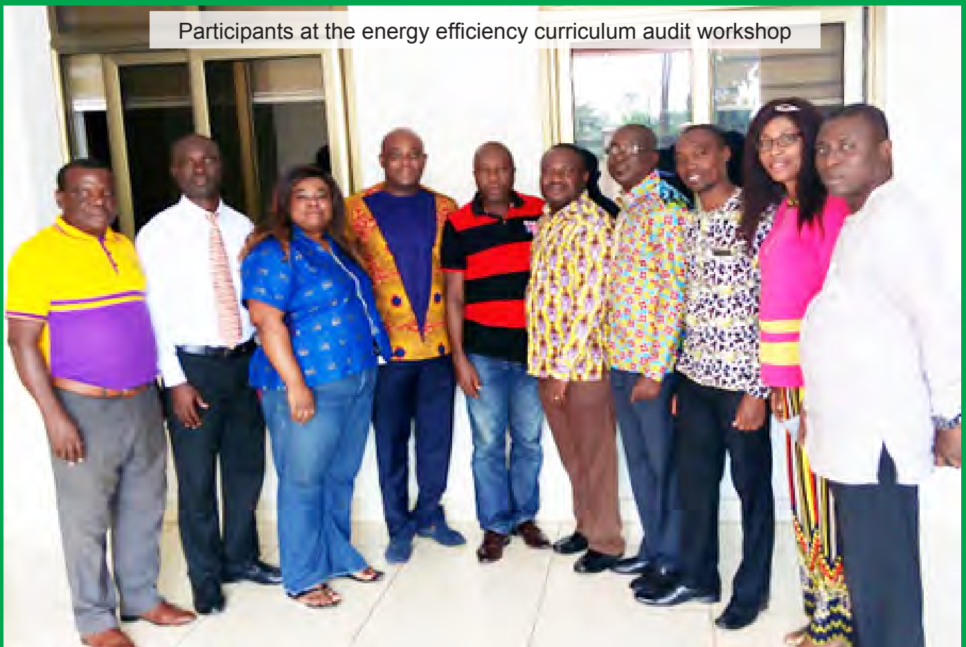
Participants at the energy efficiency curriculum audit workshop

The workshop is part of various activities under the Energy Efficiency and Demand Side management project, one of six projects making up the Ghana Power Compact Programme. The Compact identifies energy efficiency and conservation as an important strategy towards addressing the perennial power challenges Ghana faces, and therefore leverages on the valuable contributions schools and educational institutions can make towards socialization and distribution of information about clean energy to the youth and their parents.