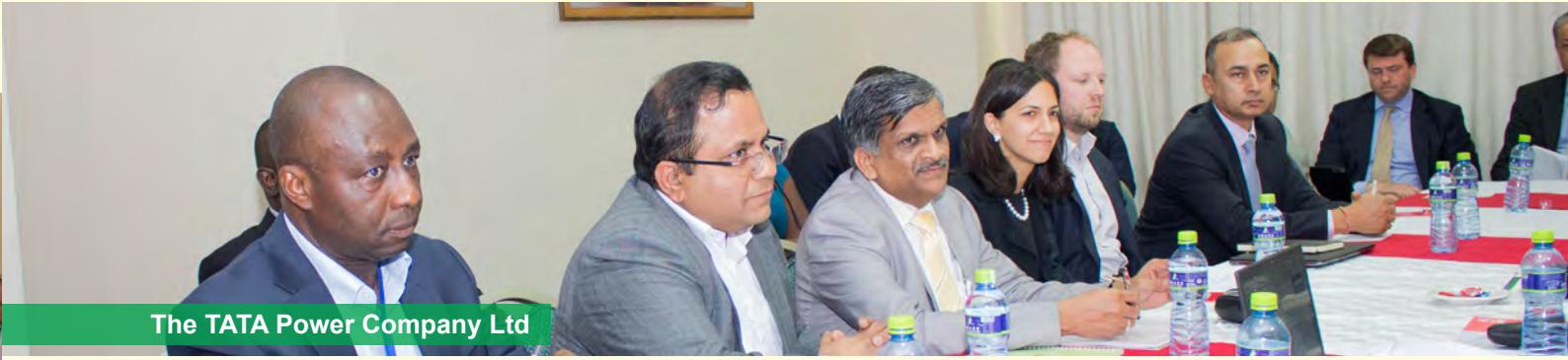
The TATA Power Company Ltd