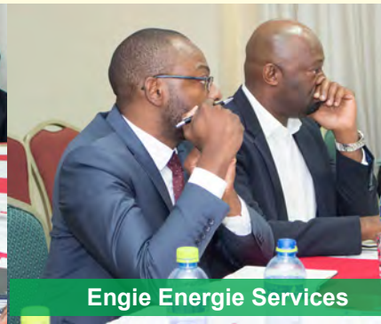
Engie Energie Services