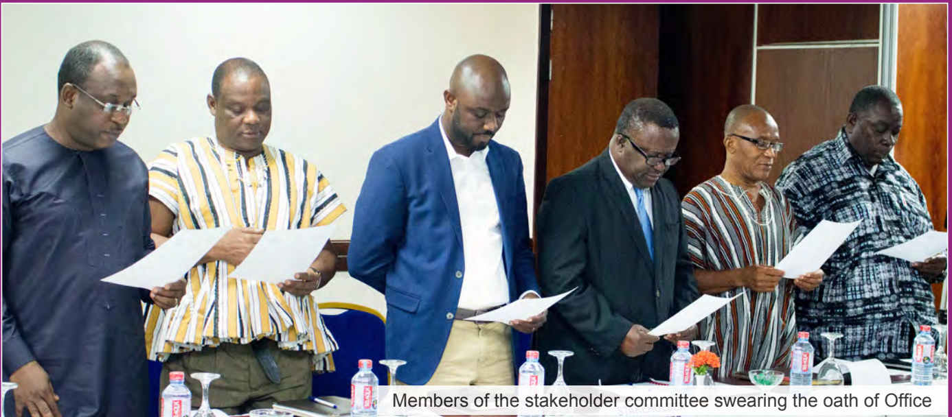
Members of the stakeholder committee swearing the oath of Office

A seven member Stakeholder Committee was on May 10 inaugurated in Accra. The Committee, which would deal with the Electricity Company of Ghana (ECG) Private Sector Participation (PSP) Activity, is tasked to ensure continuous stakeholder engagement during the implementation of the Compact II Programme. It will, in particular, review at the request of the MiDA Board specific reports, proposals, agreements, and documents related to the ECG PSP Activity.