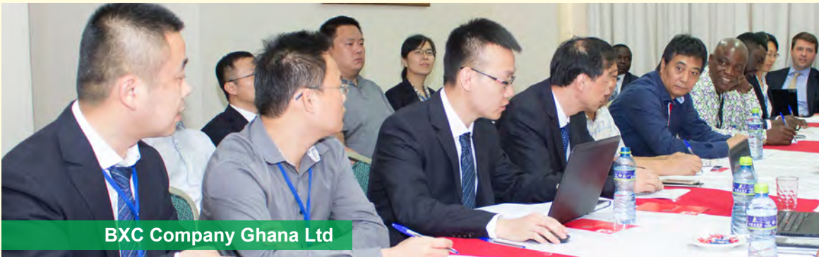
BXC Company Ghana Ltd