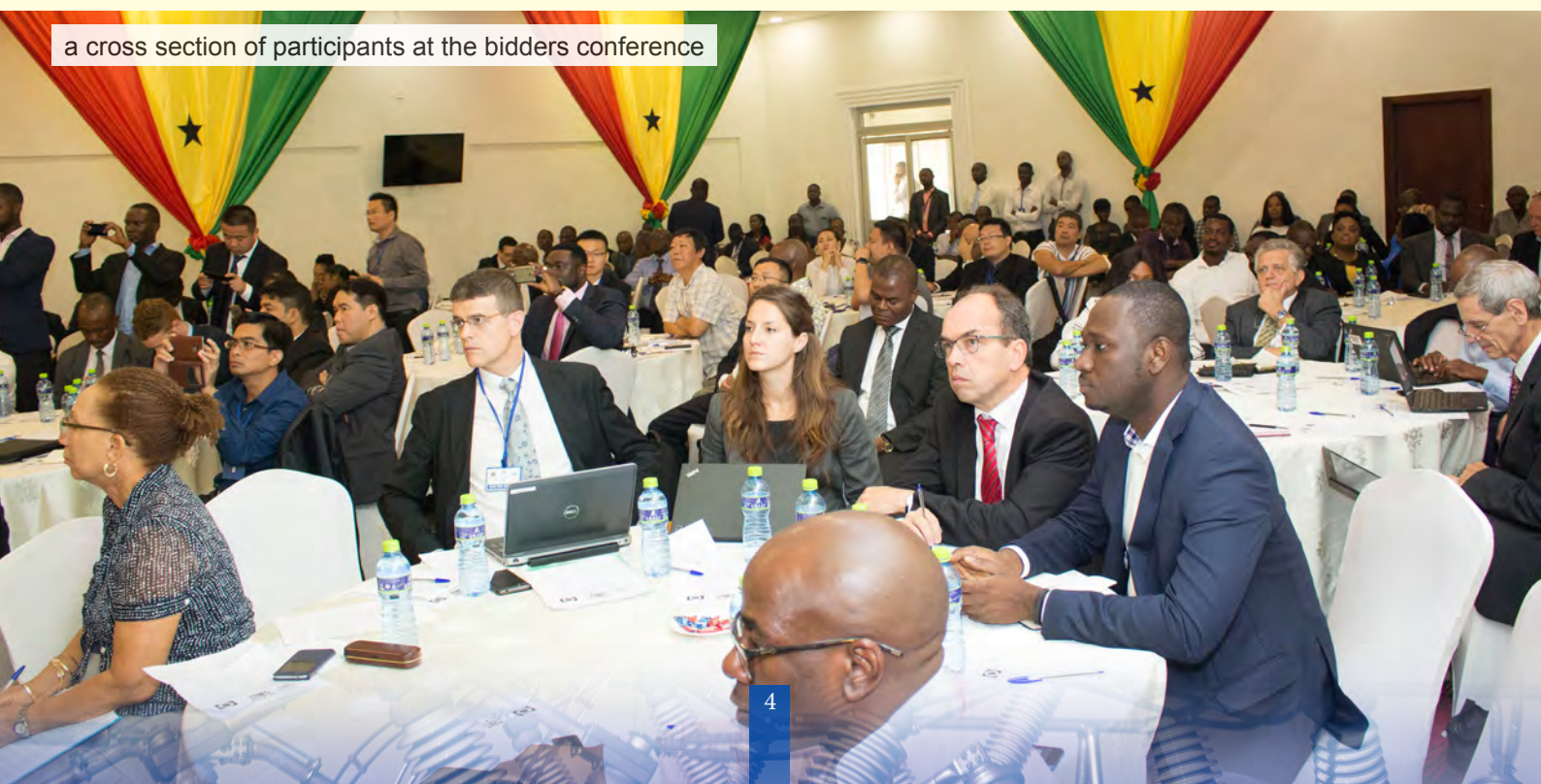
a cross section of participants at the bidders conference