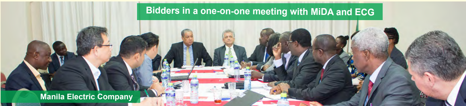
Manila Electric Company