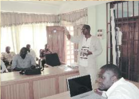
... At Mampong