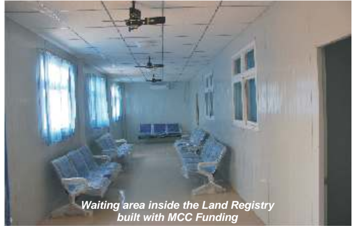
Waiting area inside the Land Registry built with MCC Funding