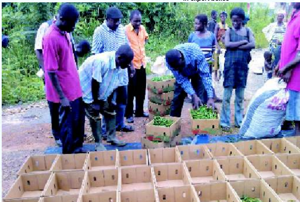
Weighing and packing pepper in export boxes