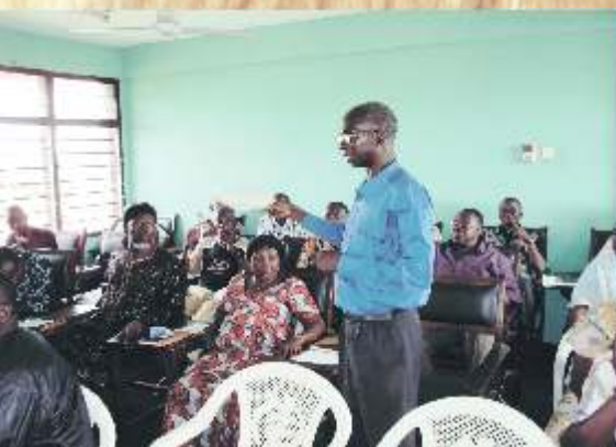
... At Effiduase