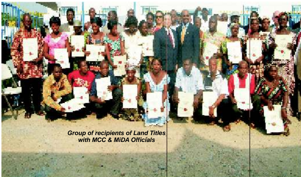
Group of recipients of Land Titles with MCC & MiDA Officials