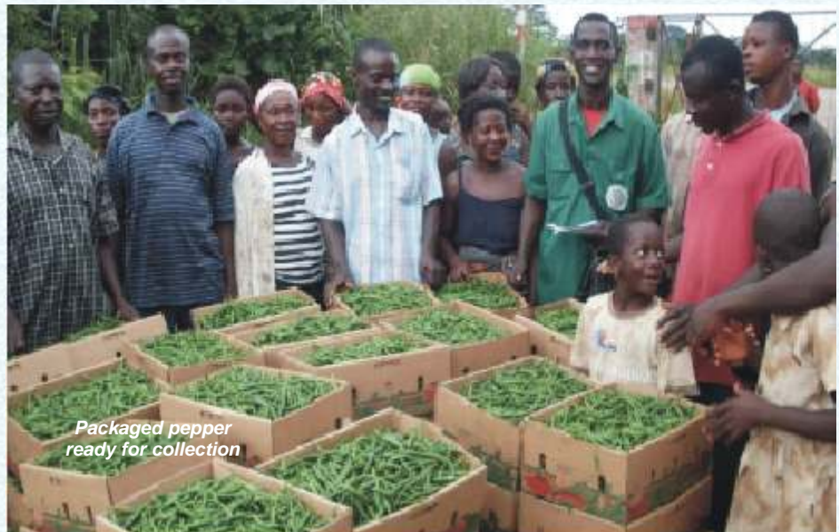
Packaged pepper ready for collection

July 2009. Additional purchases have been scheduled in the coming weeks and increased quantities and increased incomes will be made as the pepper plants approach their peak yields.