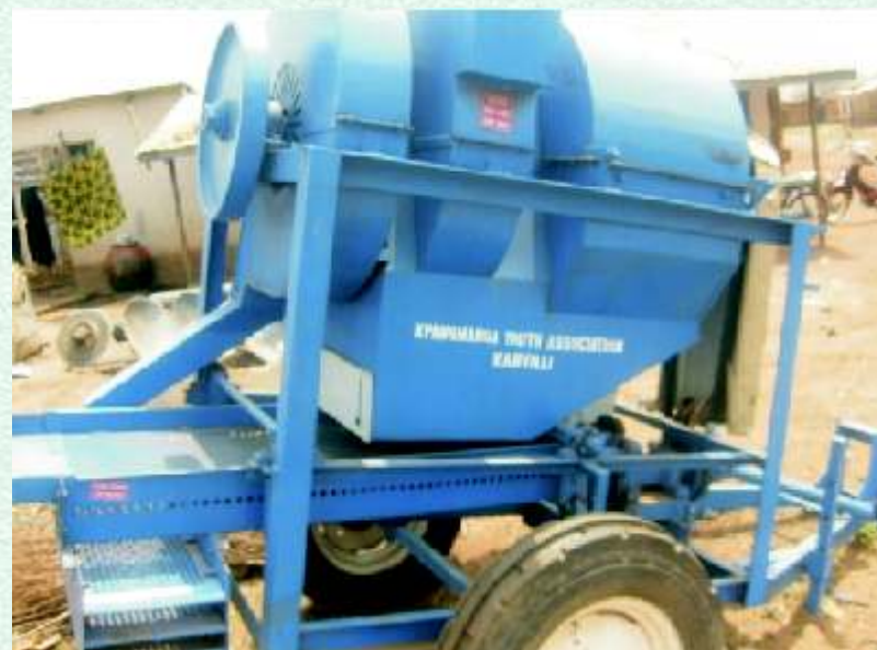
Maize sheller acquired by the Youth Association

a facility at MOFA where groups who can raise an initial deposit could acquire a tractor with the implements and a maize sheller at a cost of Thirteen Thousand Four Hundred Ghana Cedis (13,400). They expressed interest in the facility and wrote accordingly to the MOFA Regional Office. When their request was accepted the group was asked to make an initial deposit of Six Thousand Seven Hundred Ghana Cedis (GHc 6,700). The group through the sale of their starter pack maize and their weekly contribution raised Six Thousand Seven Hundred Ghana cedis (GHc6,700) and paid for the equipment. On 30 th December 2009, the group took delivery of the tractor and the sheller in Accra and paid One Thousand Ghana Cedis (GHc 1,000) to transport the equipment to Tamale. The tractor was immediately put to work during the dry season and 20 acres of farms were ploughed. An amount of Eight Hundred Ghana Cedis (GHc800) has been realized from the activities of the tractor. A four member tractor operation committee has been established and a separate bank account has been opened where all proceeds from the tractor activities will be lodged to help the group pay the full cost by 30 th December 2012. A 15 acre group farm will be established in the coming season for the group where proceeds from the farms will be paid into the tractor service account.