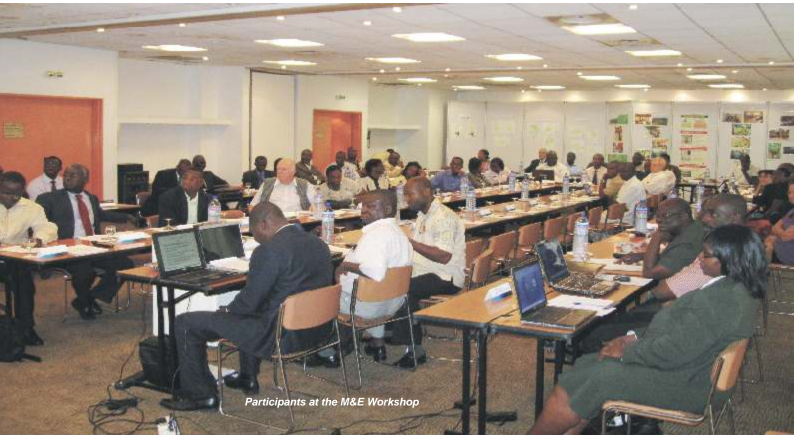
Participants at the M&E Workshop