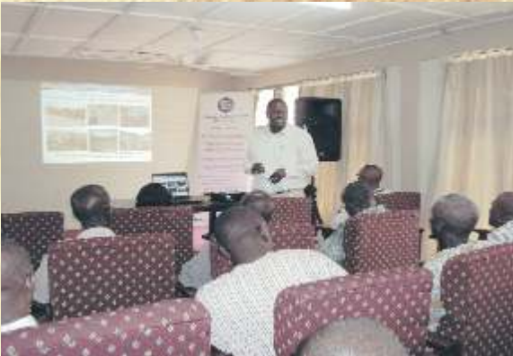
... At Ejura