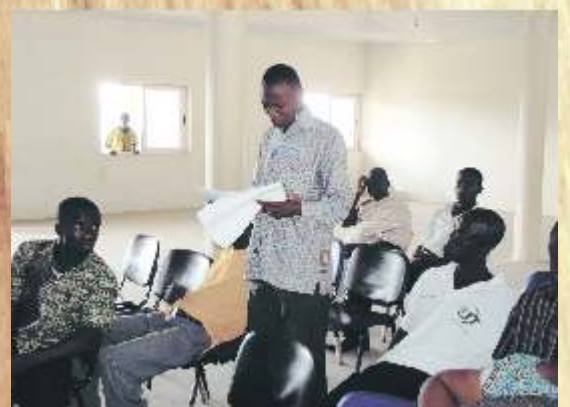
... At Kumawu