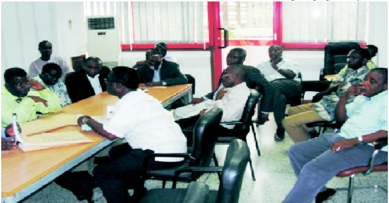
Members of the audience listing attentively during the signing ceremony.

Having signed IDIQ contracts, these contractors have become eligible for the award of subsequent Works Order for the construction of water supply s.