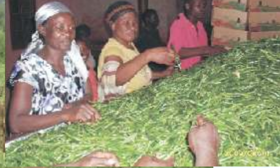
Farmers Sorting pepper for packing before export