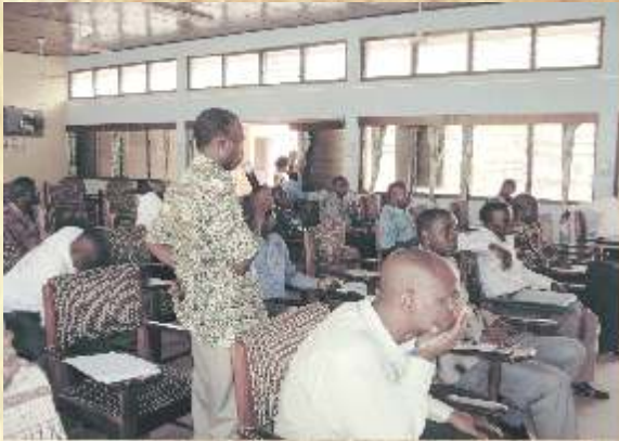
... At Akatsi