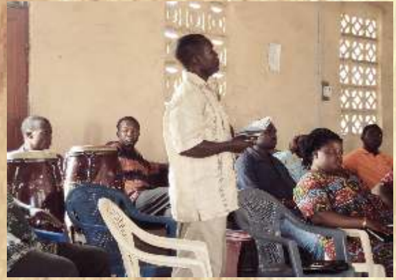
... At Awutu-Senya