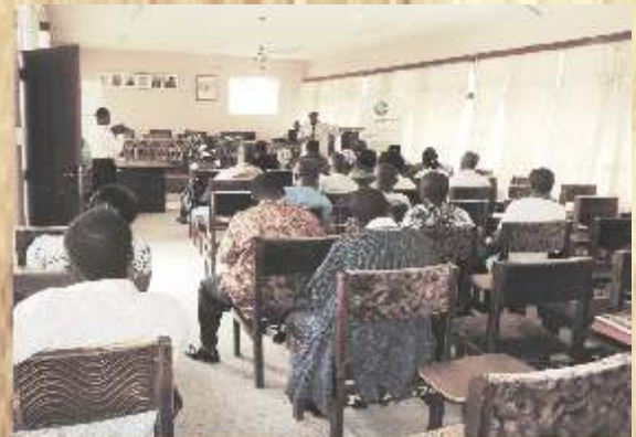
... At Mpraeso