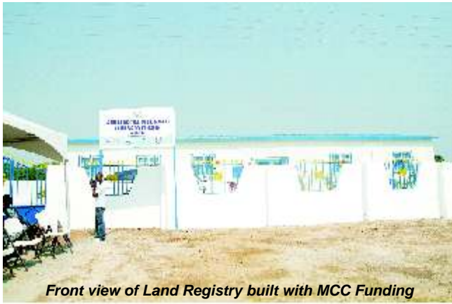
Front view of Land Registry built with MCC Funding