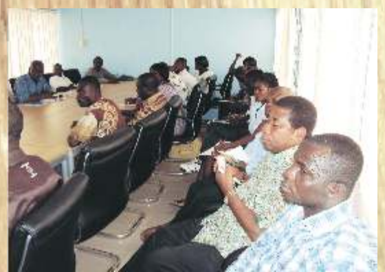
... At Donkorkrom