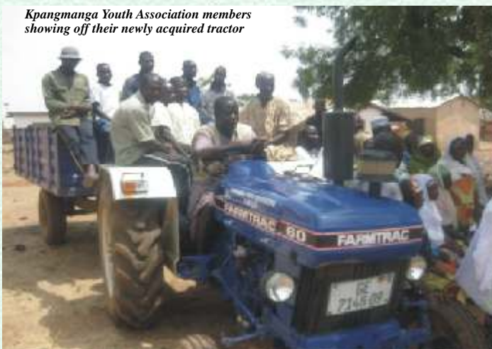
Kpanmanga Youth Association members showing off their newly acquired tractor

A group of 20 men and women in Kanvilli a